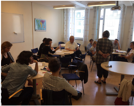
Stockholm, SFX – Swedish for professionals in the Stockholm county

In Stockholm focus during the study visit was primarily on language. Measures that were introduced were for example language training for professionals, both for academic and non-academic professions, and vocational training with integrated language learning.”