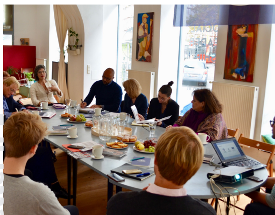
Wien, SINDBAD, a private job-mentoring association

“Vienna presented a diverse aspect of measures, especially for young people. That include mentors for youth with immigrant background and Spacelab, a hub organized by NGOs where young people are encouraged to gain new skills through creativity.”