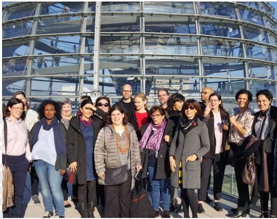
Berlin, Senate Department for Integration, Labour and Social Issues

“Berlin gave us an introduction to many measures and support for newcomers, both fixed institutions like Jobcentre. And examples of in outreach work in local neighbourhoods through the method Stadtteilmütter, and Mobile Education Counselling (MoBiBe), counselling for immigrant women on different locations in several languages.”